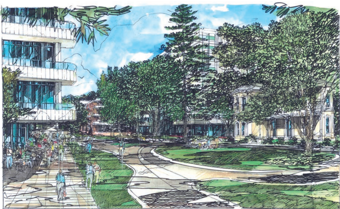
Artists impression: Entrance to site from Wellington Street.